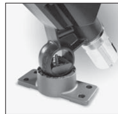
Cup Plate Assembled