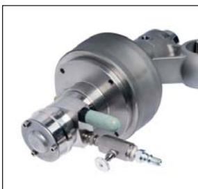
Stainless Steel Air Motor